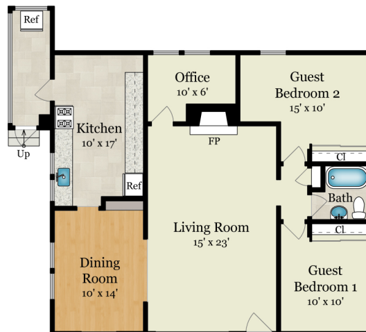
GUEST HOUSE 2